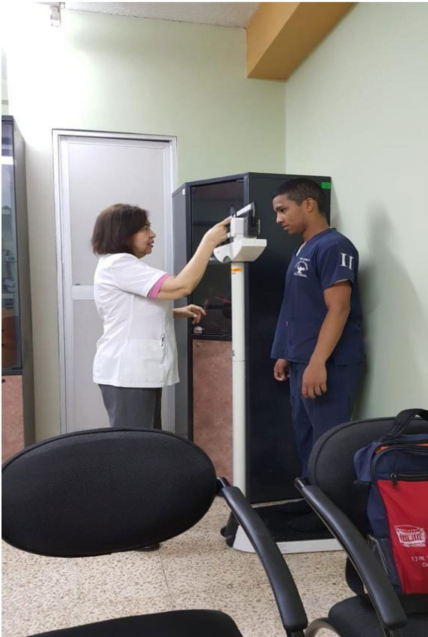
S2.1 Measurement of body weight