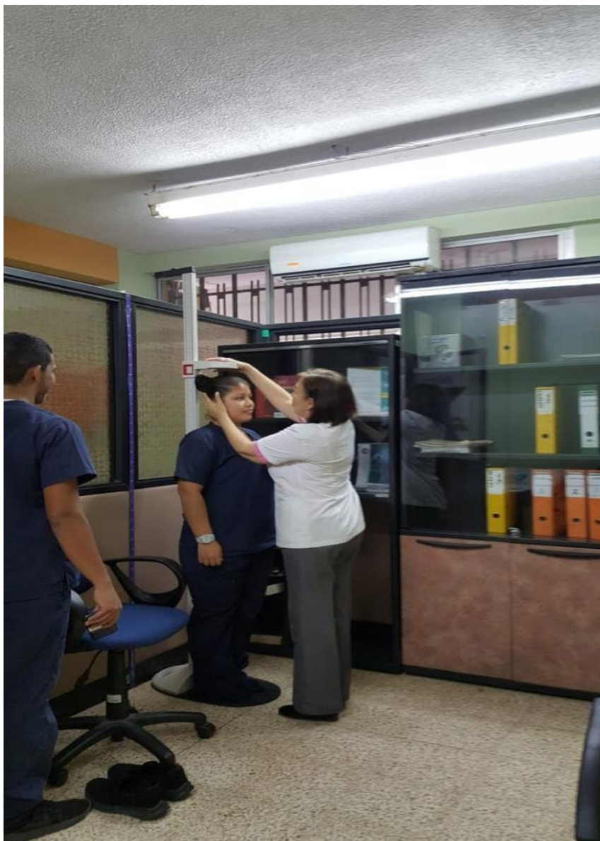
S2.2 Measurement of height